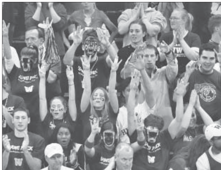
Washington's home attendance average has risen from 628 fans per match in 2000 to 3,211 fans per match last season. The Huskies led the Pac-10 in attendance last season and had the fifth-highest average in the nation.