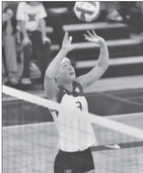
Courtney Thompson had 14.66 assists per game last year to lead the Pac-10 and rank third nationally.